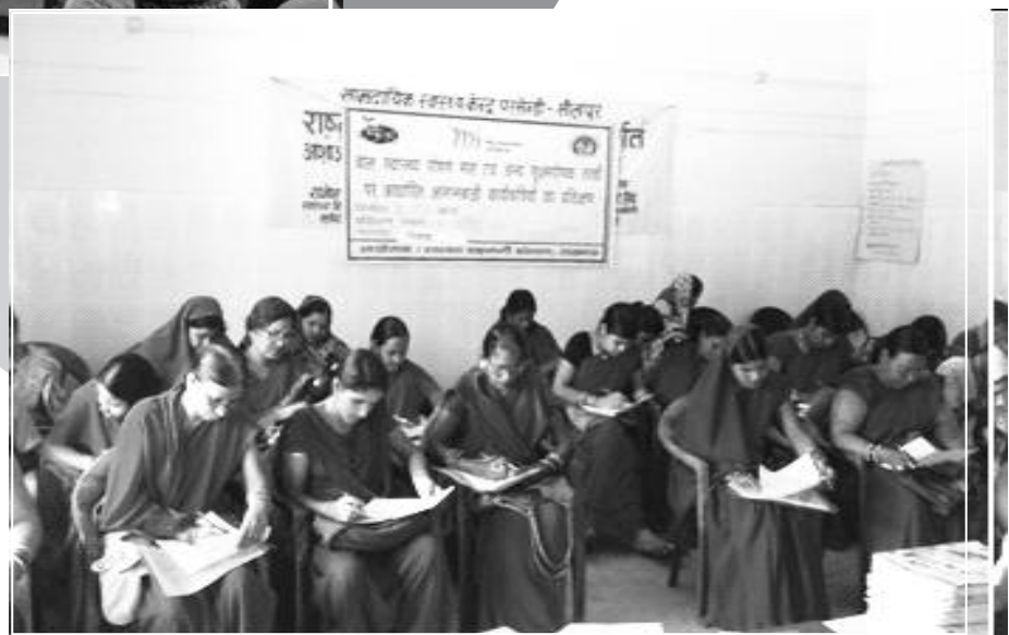
AWW Training in Sitapur