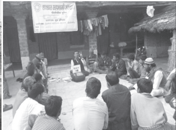
Equine welfare program activities at the community level are in progress