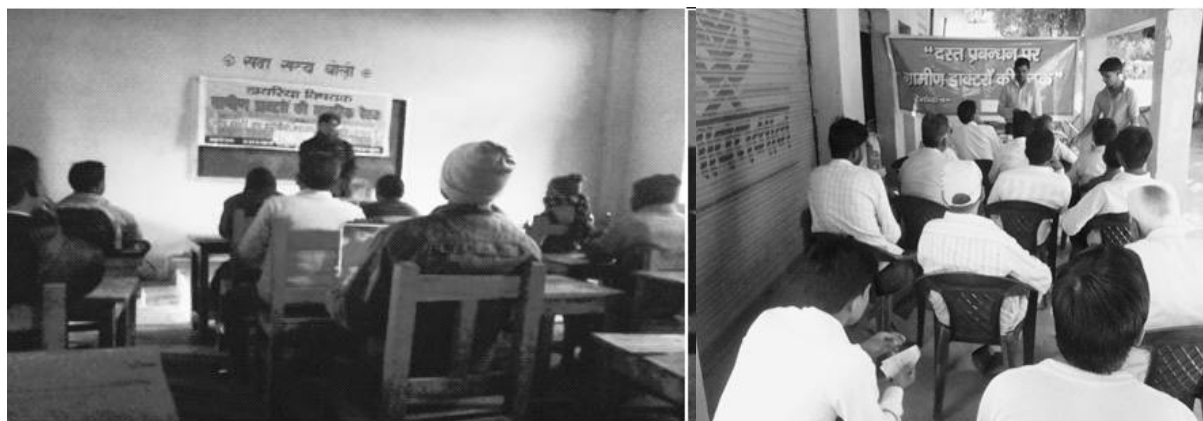
CMEs with RMPs at community and CHCS in progress