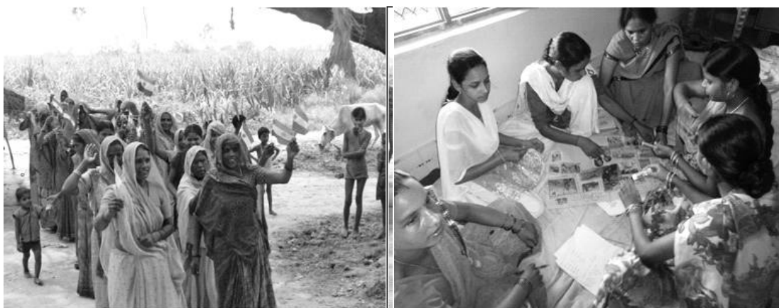
Celebration of republic day and teachers workshop in progress under literacy program.

Achievement : Understanding on gender perspective and negative consequences of gender discrimination has build among project team and community itself. Good understanding on right based among learners and project team as well. Improvement in numeric and qualitative education. TLM based teaching at the WELCs and producing TLM at the centers as per need of the learner. Regularisation of women at learning centre. Competitive feeling developed among women.