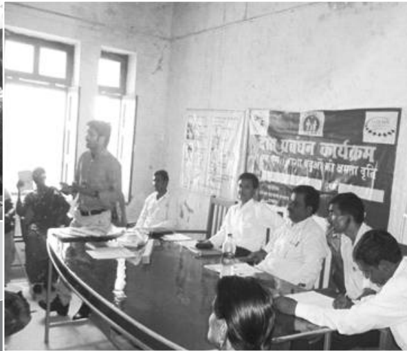
FLWs Training by SSS Team