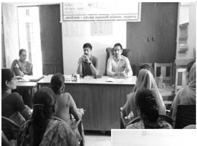
AWW Training in Lakhimpur

Anganwadi workers were provided training in Sitapur and Lakhimpur districts. Total numbers of participants were 2875 with the support of GEAG (Gorakhpur environmental action group) and MI (Micronutrient Initiative), Shashwat Sahbhagi Sansthan was able to accomplish this training. The participants were provided knowledge on Vitamin A and other micronutrients.