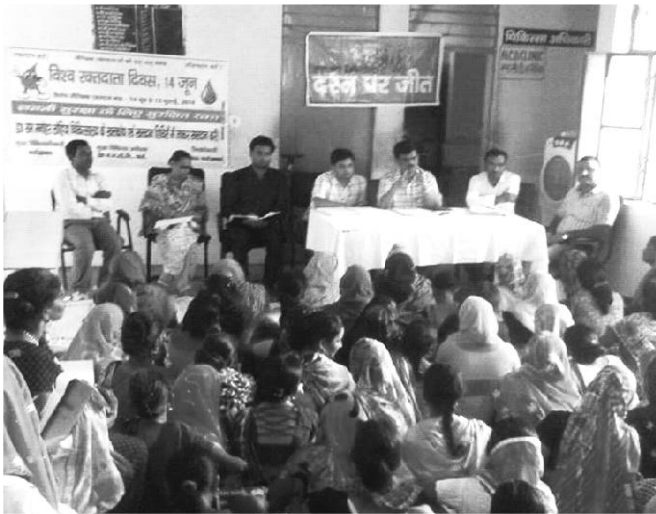
FLWs Meeting with CMO